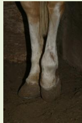
Lameness can be difficult to diagnose and treat; acupuncture may be a helpful alternative.

Veterinary acupuncture and acu-therapy are considered valid modalities, but the potential for abuse exists. These techniques should be regarded as surgical and/or medical procedures under state veterinary practice acts. It is recommended that extensive continuing education programs be undertaken before a veterinarian is considered competent to practice acupuncture.